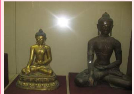
Field Trips • Bagh Bhairab • Bhaktapur Durbar Square • Patan Durbar Square • Chhauni Museum