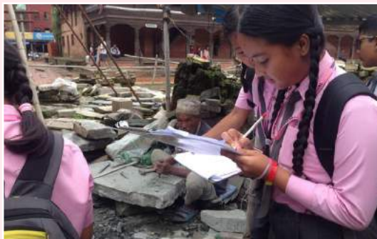
OBTE • Use of local technology