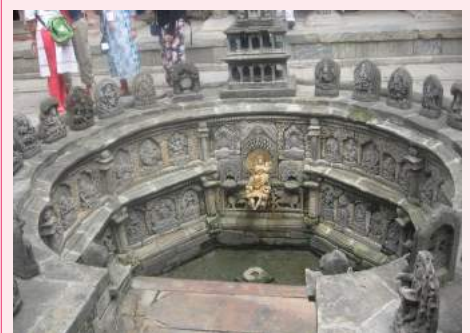
Social Studies • Art and architecture of medieval Nepal