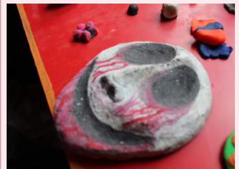
OBTE • Types of handcraft