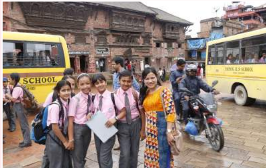
Field Trip • Bhaktapur Durbar Square