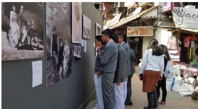
Photo Kathmandu 2018 Immersion Visit

On 16 November, Grade X D students went for a photo walk at 'Photo Kathmandu 2018' which was organized by Photo Circle. One of the themes that the students visited was centered on 'The Public Life of Women: A Feminist Memory Project'.