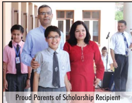
Proud Parents of Scholarship Recipient