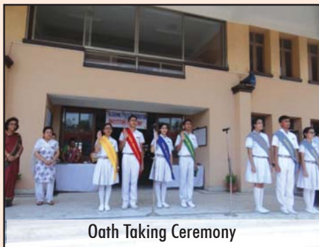
Oath Taking Ceremony