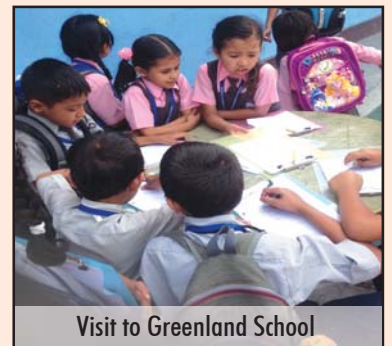
Visit to Greenland School