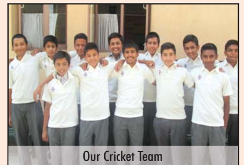
Our Cricket Team

Our young cricketers made us really proud in the Inter School Cricket Tournament organized by Modern Indian School. In a nail biting match, we failed to score 3 runs with just mere two balls remaining to win. It's part and parcel of the game boys!!