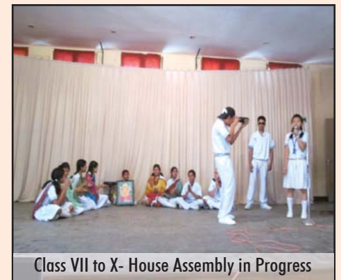
Class VII to X- House Assembly in Progress

The Inter House Assembly for seniors was held on 23rd May. Students of the four houses portrayed their talents and creativity in the program. Phewa House were the overall winners followed by Rara and Begnas House respectively.