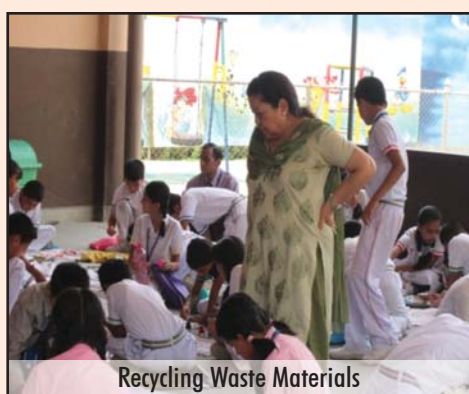
Recycling Waste Materials