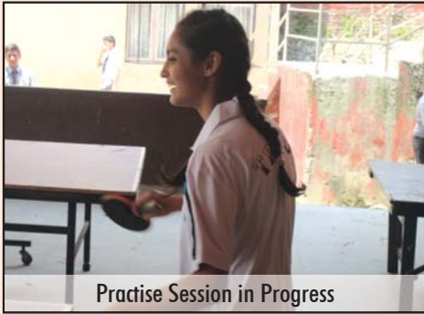
Practise Session in Progress