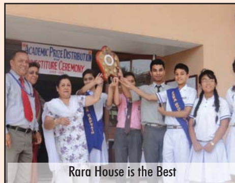
Rara House is the Best