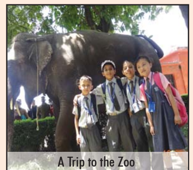
A Trip to the Zoo