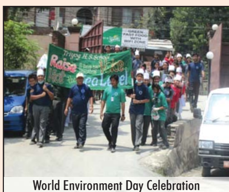
World Environment Day Celebration