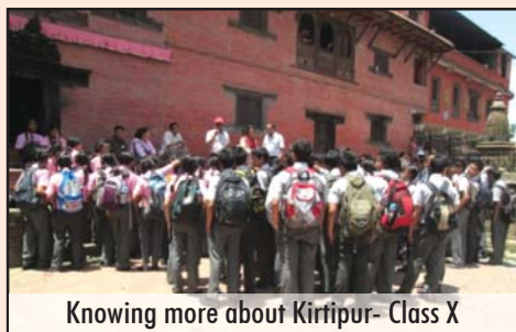
Knowing more about Kirtipur- Class X