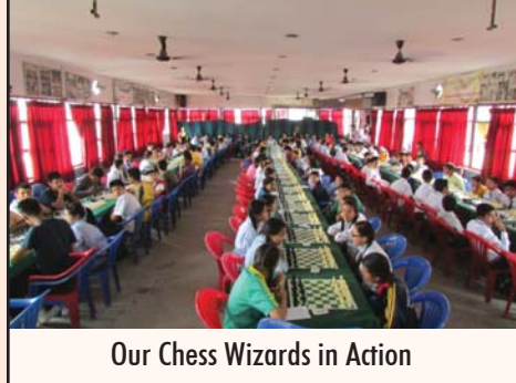
Our Chess Wizards in Action