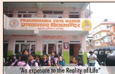
"An exposure to the Reality of Life"