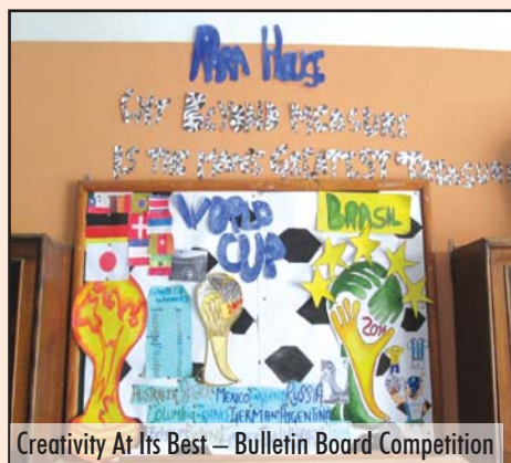
Creativity At Its Best – Bulletin Board Competition

We maintain four Bulletin Boards one for each House which is prepared very passionately and competitively by the students belonging to each house under the guidance of the captains and prefects. The theme for the month of May was 'The 1970s' and each house tried their best to outdo the other houses. Begnas and Phewa House were the overall winners. The topic for the month of June was 'The World Cup 2014' as a part of our World Cup Celebrations'.