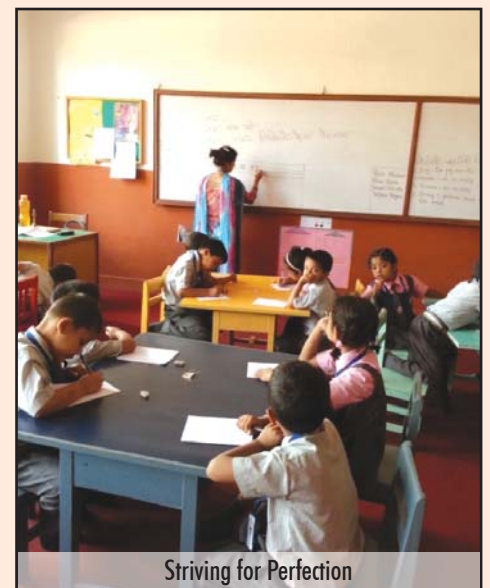
Striving for Perfection