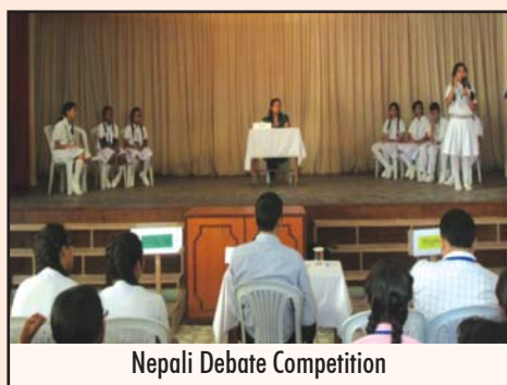
Nepali Debate Competition