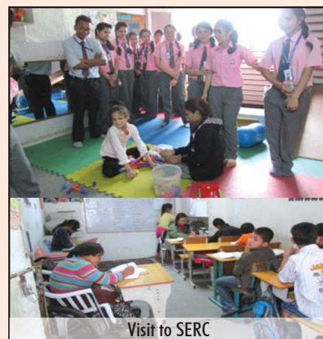
Visit to SERC

We look forward to yet another successful session with the help of your support and cooperation.